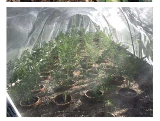
Carrots nestling under Enviromesh