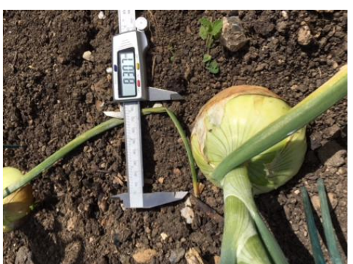
As the onion class competition hots up, a new way of making sure size is correct